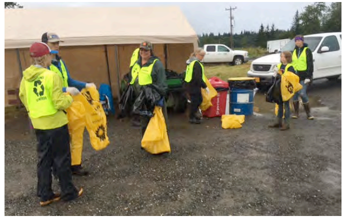
Each morning starts like this ...