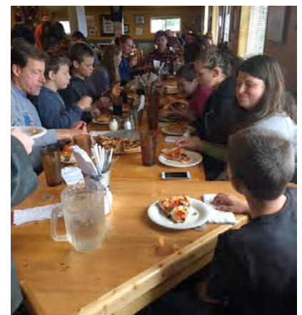
Celebrating trash days with pizza!