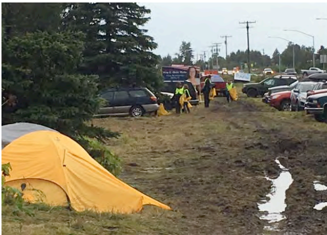
Picking up trash in the campground