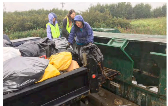
Just off-loading another truckload of trash in the rain!