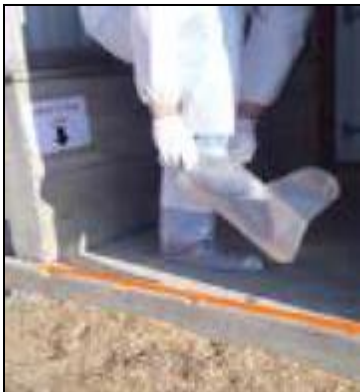
Left: Covering up with disposable coverall and plastic boots over footwear