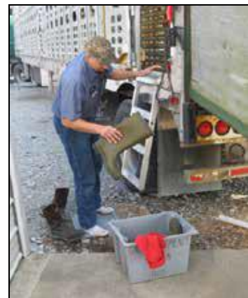
Right: Containing washable coveralls and footwear that is soiled for transport to site of cleaning