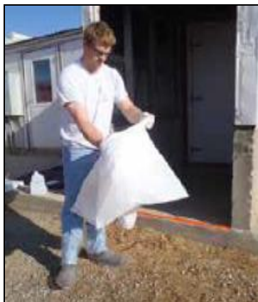
Left: Containing disposable coveralls and plastic boots in garbage bag for disposing